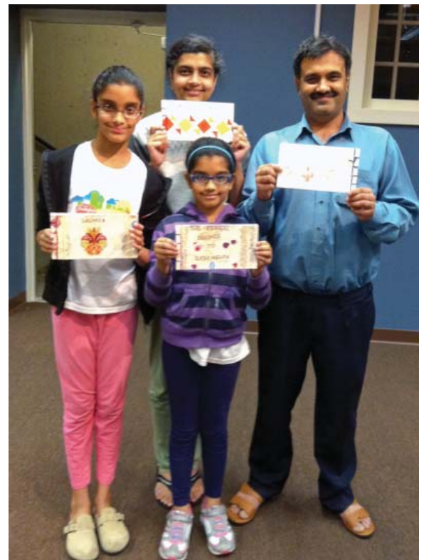
Crafts at A Midsummer's Night Celebration

We embarked on a new program series entitled Culinary Conversations featuring cookbook authors, foodie films, and educational programs relating to food. Writing programs continue to be popular with our community and 2012 featured the following workshops: Becoming American , Saving Grace , The Things We Saw , Poetry with Barbara Ungar , and Travel Writing . Two weekly writing support groups meet at Central and several of the participants have had their work published this past year, with one being featured on NPR. The free Sunday afternoon concerts series provided by the Friends of the Library Music Committee draws attendees not only from Schenectady County, but beyond. Efforts continue to provide something for everyone, from the arts - featuring An Afternoon