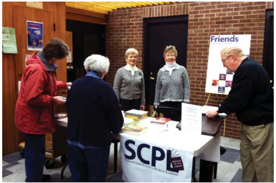
The Friends of the Library