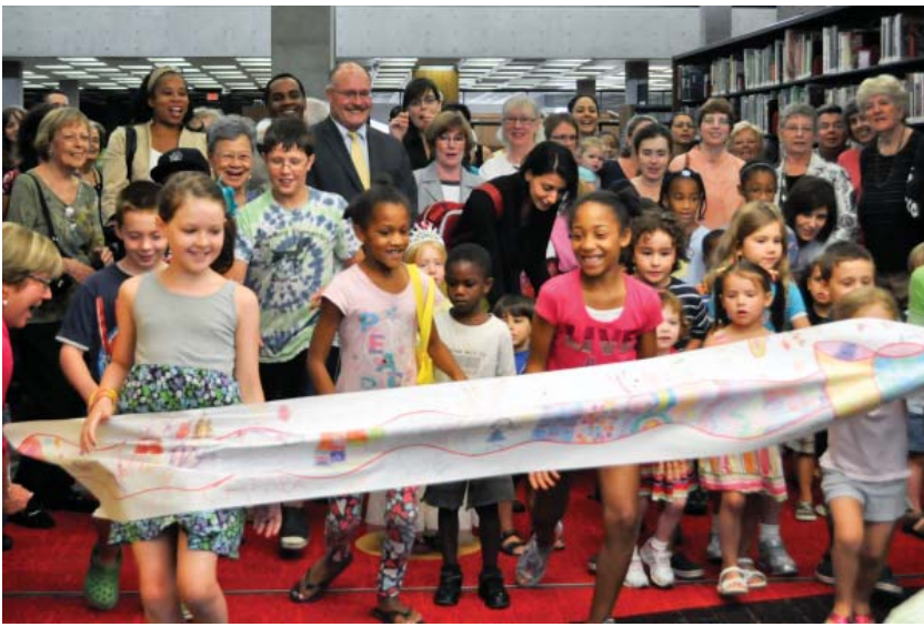
Ribbon Cutting Ceremony for the Wright Family Center

at the Movies Oscar program with a local film writer and professor - to the sciences, with a series of programs on genetics and mummies.